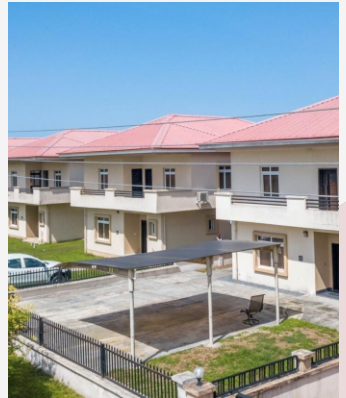
Adiva Plainfields Estate