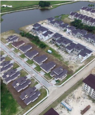
Lakowe Golf & Country Estate