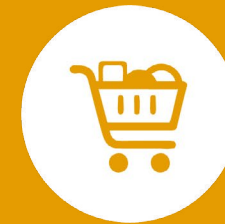
Local Shopping Complexes & Mini Marts