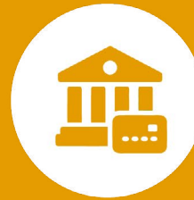
Access to Financial Institutions