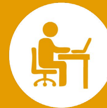
Access to Office Spaces